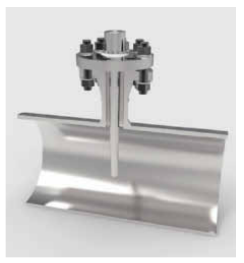
Typical temperature measuring point with thermowell

Many users position the measuring point directly in an elbow. However, this then leads to the next question, namely whether the thermowell should be installed facing upstream or downstream – and this time the answer is rather less straightforward. It all depends on which part of the world you happen to live in. Whereas the German VDI 3511–5 directive recommends installing it facing upstream, the Russian Gost 8.586.5 describes installation facing downstream. The American ASME PTC 19.3 TW-2016