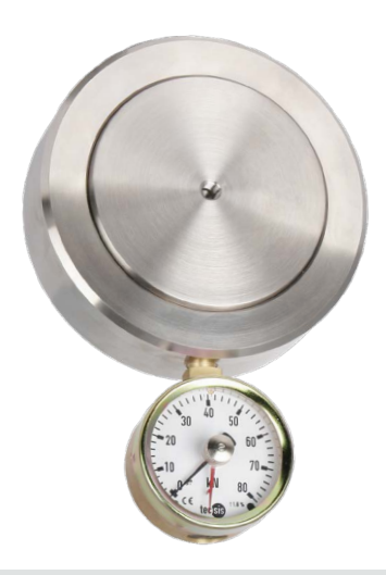
Hydraulic compression force transducer, model F1135