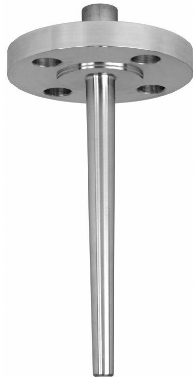
Thermowell with flange Model SI450F

Insertion length U 1 + connection length T