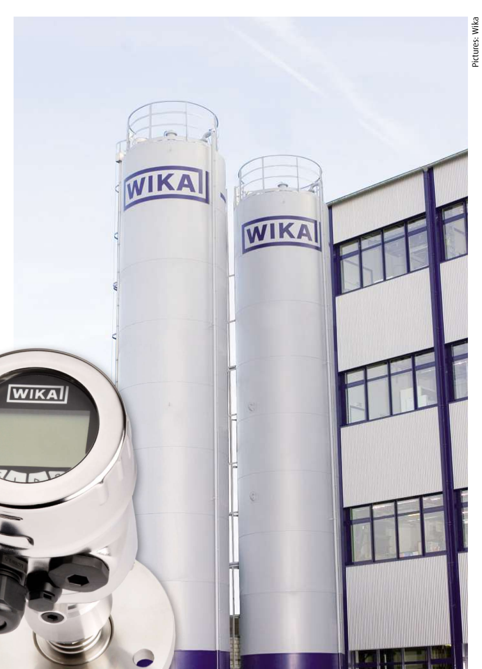
Tank measurement with a process transmitter

In most instances, the manufacturer supplies a sensor with the start of the measuring range at 0 bar relative or absolute. However, those values within the lower pressure range are sometimes not the focus of the plant monitoring. For example, an operator might only be interested in the upper 20% of a measuring span, since a safety shutdown might need to be triggered at higher pressures, while lower pressures never occur in the course of the process. Being able to set the sensor so that this upper range is covered by the full span of the 4...20 mA signal is only available with proc-